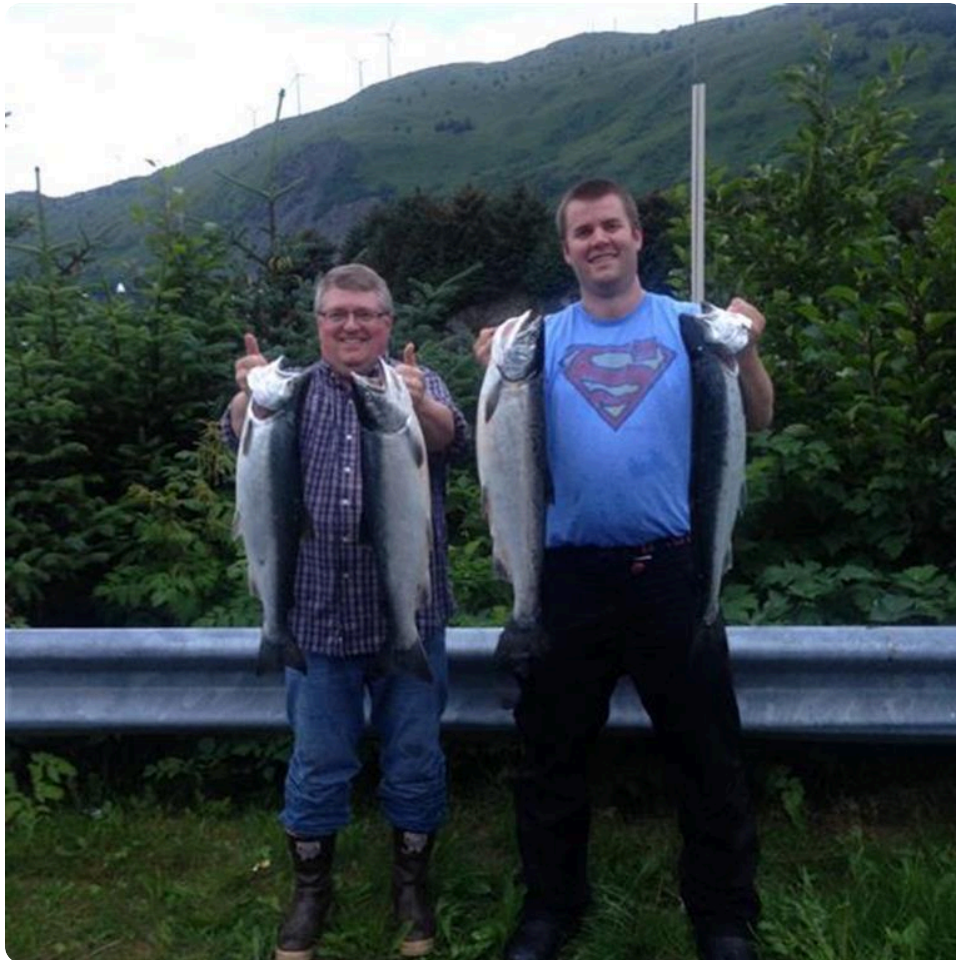
Silver fishing in Kodiak, Alaska